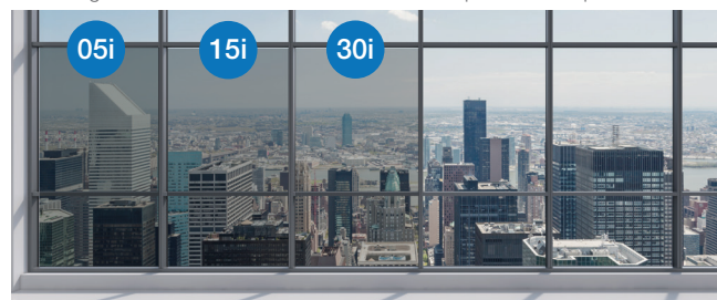
NT Natura 05i | NT Natura 15i | NT Natura 30i

This image has been simulated and is not actual product comparison