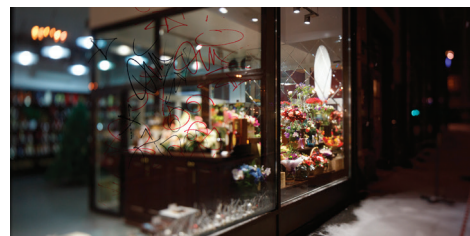
Clear Poly X